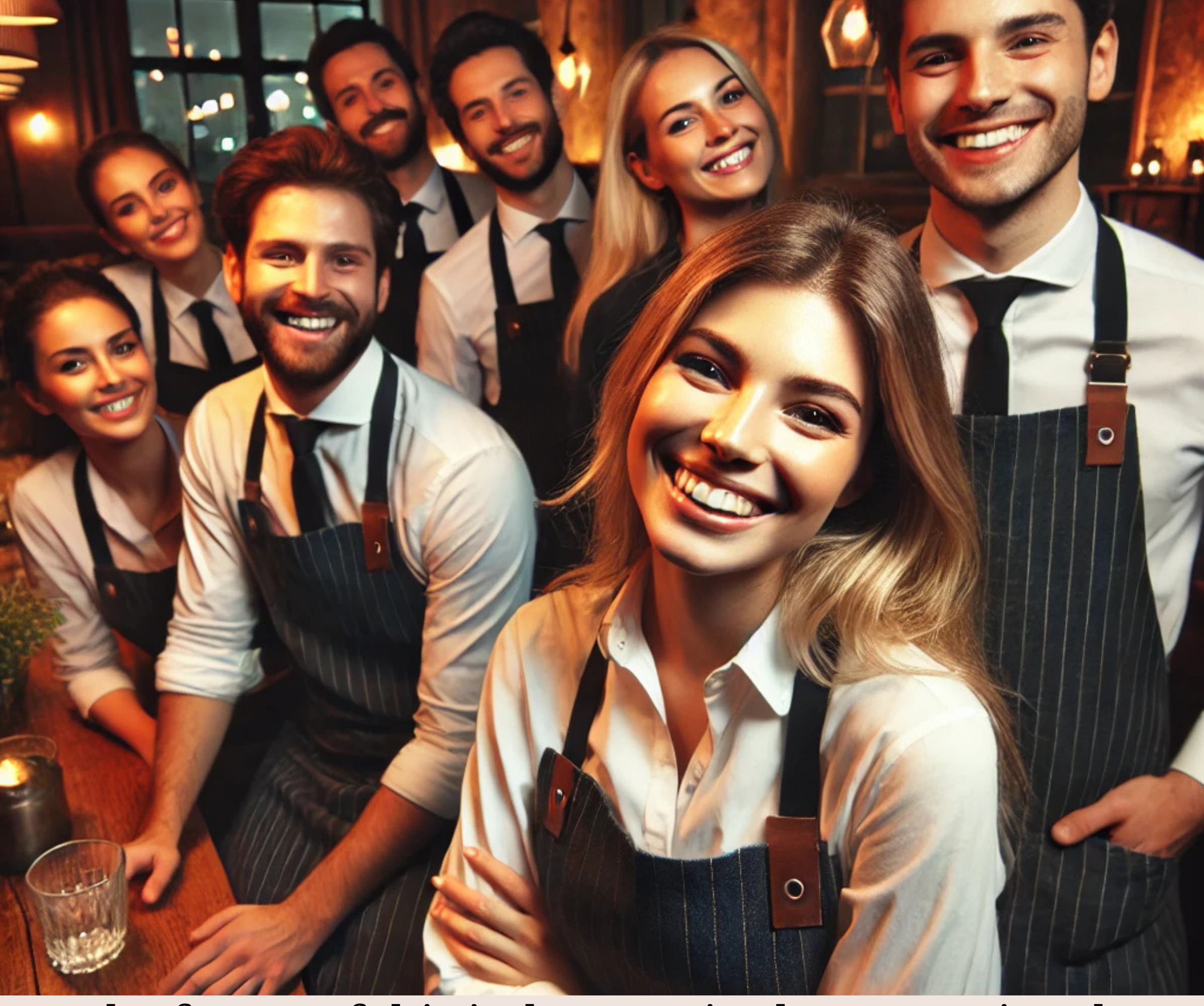
"The future of this industry... is about creating the space for people to do what they do best— With pride, with care, and with joy."