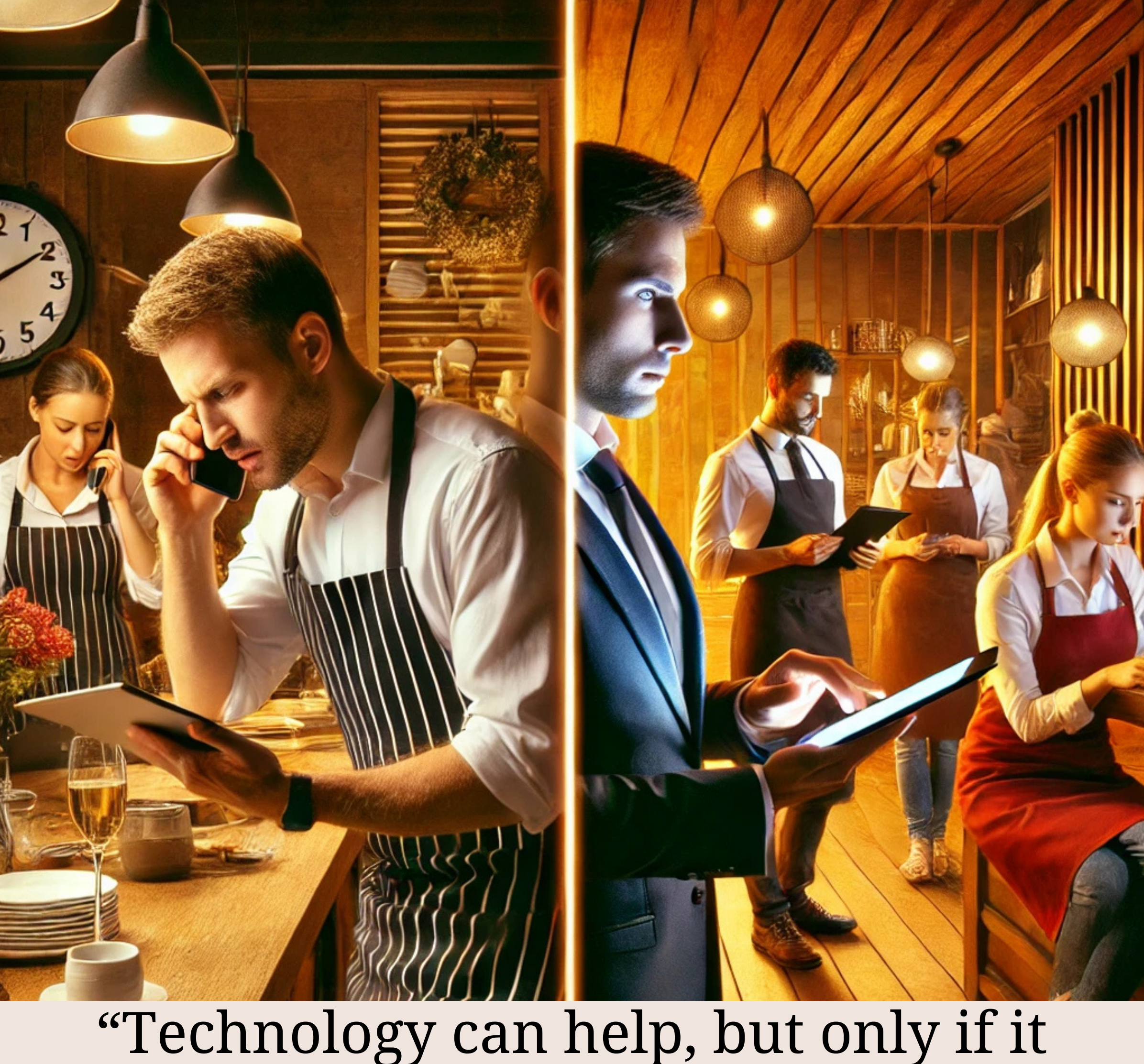
understands the rhythm of real service."