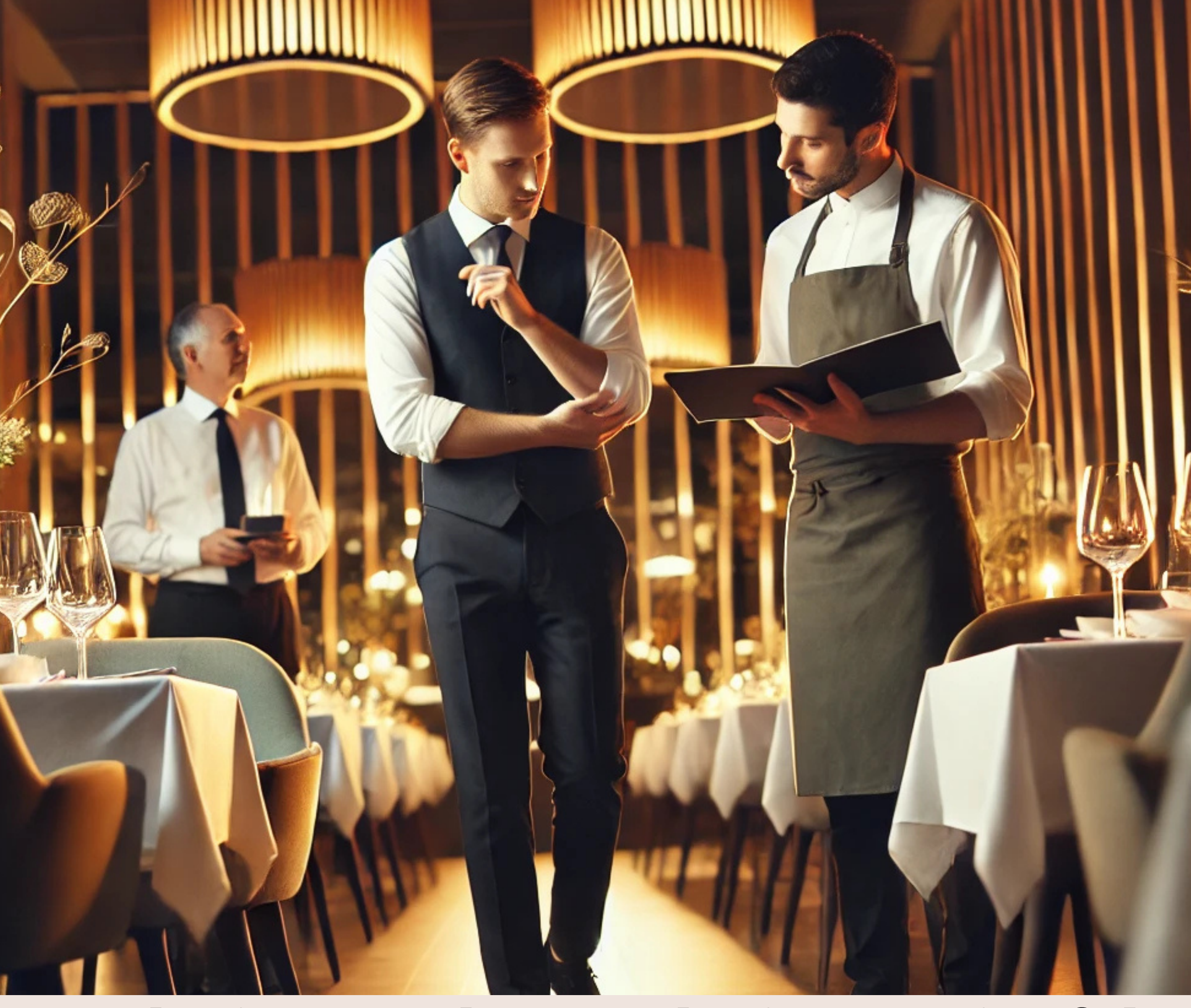
"Make it smoother. Make it meaningful. Make it easier to care."